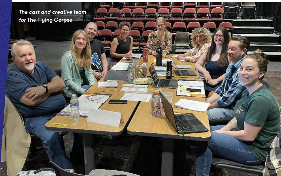
The cast and creative team for The Flying Corpse